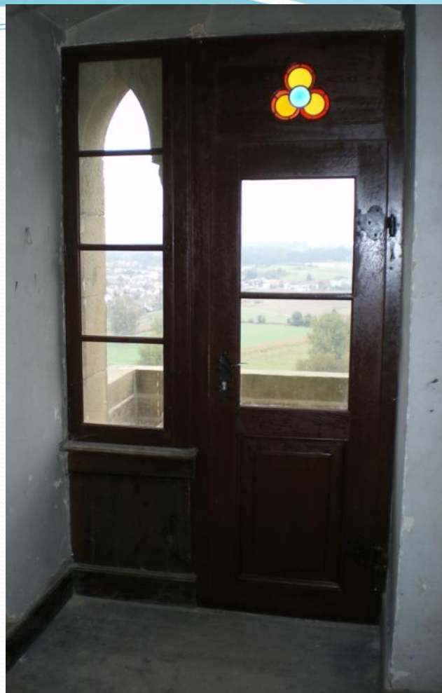
Wormser Hof Bad Wimpfen