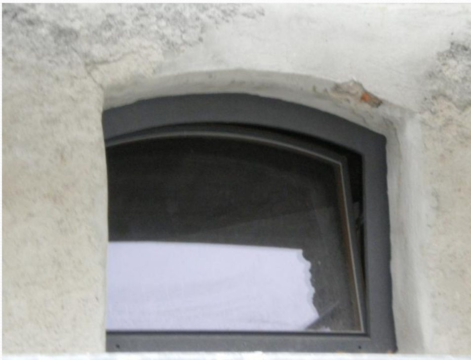
Schloßscheuer Weilheim – Metall-Holz-Fenster

Allowance should be made where the opening is not perfectly rectangular, but always ensuring that the sight line of the perimeter seal is below the sight line of the back rebate.